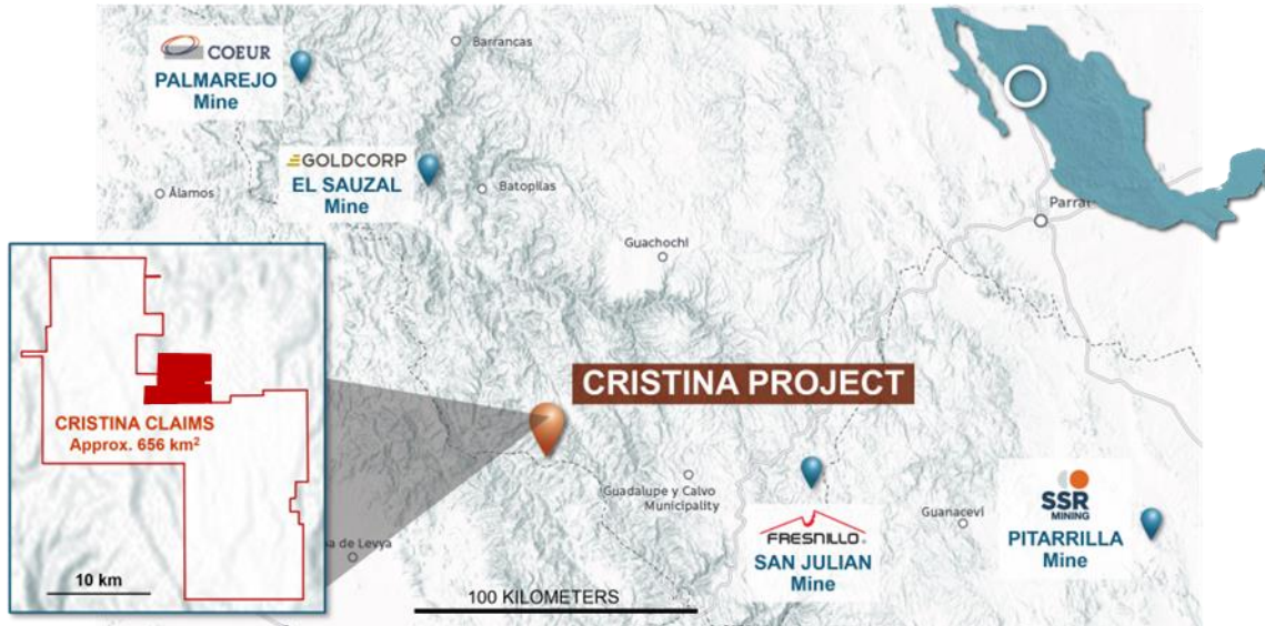
Figure 1- Location map